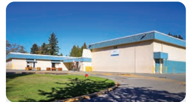
JARVIS ELEMENTARY School Population: 450