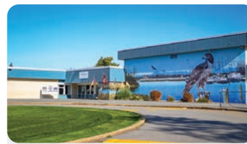
HAWTHORNE ELEMENTARY School Population: 450