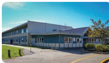
LADNER ELEMENTARY School Population: 450