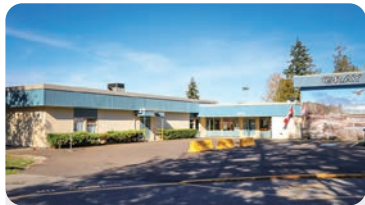
GRAY ELEMENTARY School Population: 500