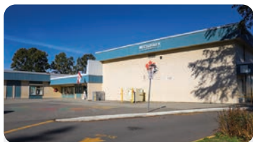
MCCLOSKEY ELEMENTARY School Population: 350