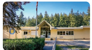
SUNSHINE HILLS ELEMENTARY School Population: 500