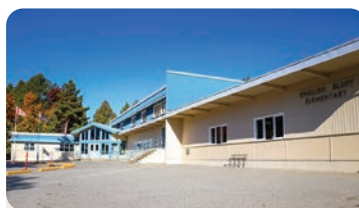
ENGLISH BLUFF ELEMENTARY School Population: 200