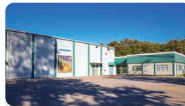
BEACH GROVE ELEMENTARY School Population: 300