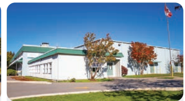
CLIFF DRIVE ELEMENTARY School Population: 300